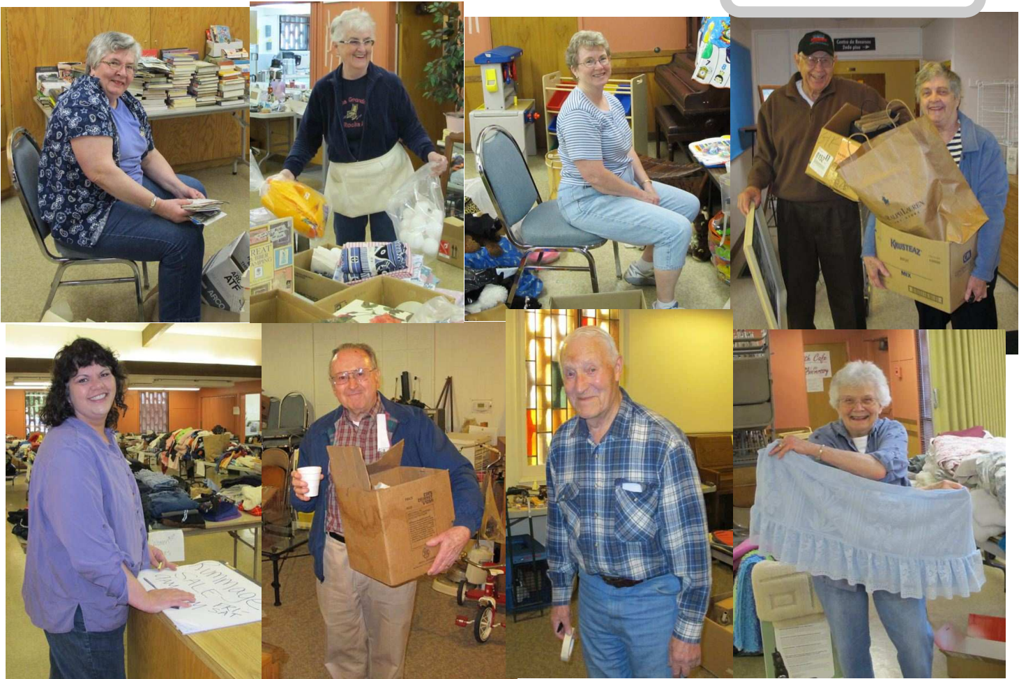
Some of the many Volunteers who helped make the Rummage sale such a success

With wings of faith, you can rise and soar.