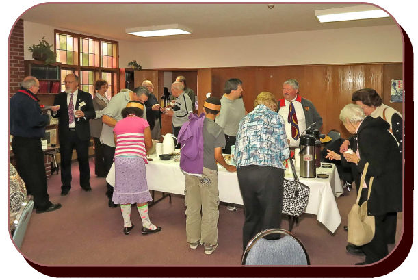
Coffee Hour at BFUMC